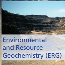
Environmental and Resource Geochemistry (ERG)