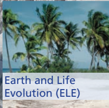
Earth and Life Evolution (ELE)

Take a look at the first hand information and discover the Specializations